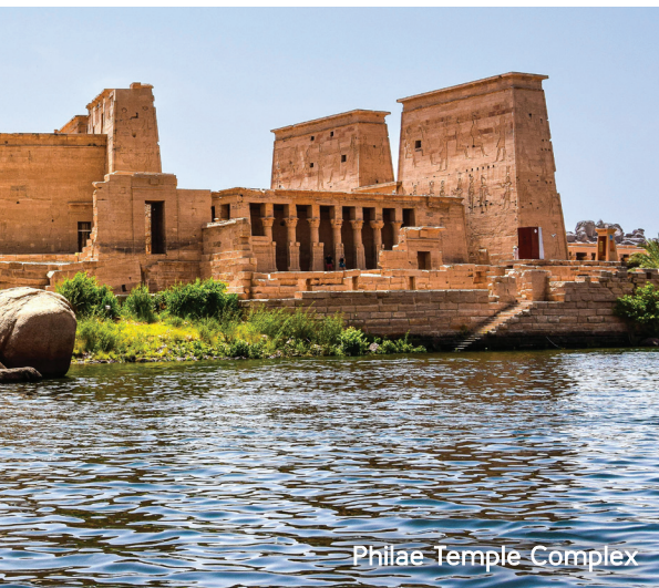
Philae Temple Complex